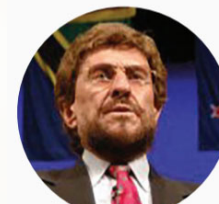
Dr. T.L. Osborn