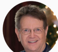
Dr. Reinhard Bonnke

Below are just a few of your video professors and their course topics.